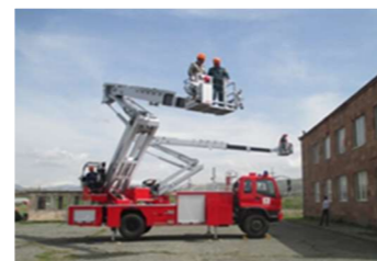
Fire fighting and paramedical treatments